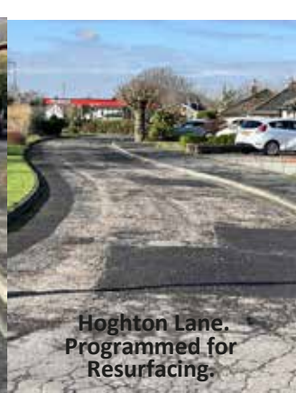
Hoghton Lane. Programmed for Resurfacing.