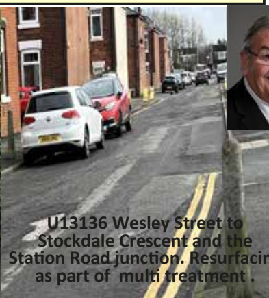
U13136 Wesley Street to Stockdale Crescent and the Station Road junction. Resurfacing as part of multi treatment.