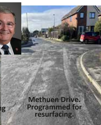
Methuen Drive. Programmed for resurfacing.